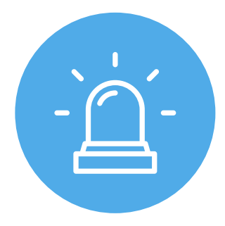
Uphold elimination of all discrimination in respect of employment and occupation