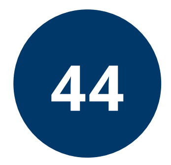
The shortlist of suppliers after running the analysis

The analysis was based on a matrix of 3 items: country of origin of product, type of product, and level of spend