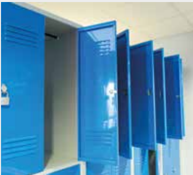
Versatile for indoor